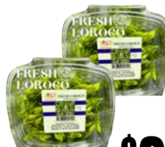
Solfi Loroco 3 oz.