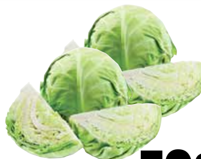
Green Cabbage Repollo Verde