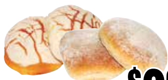
Jumbo Conchas o Semas