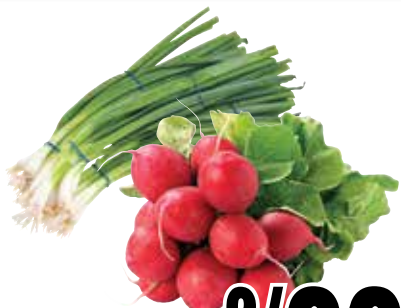
Radish or Green Onions Rabanos o Cebollita Verde