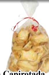
Pan Para Capirotada