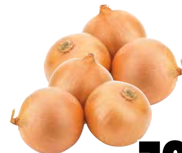
Brown Onions Cebolla Cafe