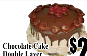
Chocolate Cake Double Layer 8" Round