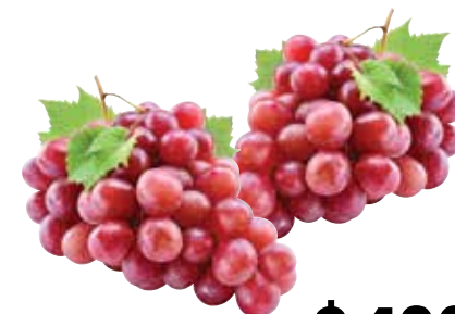
Seedless Red Grapes Uvas Rojas sin Semilla