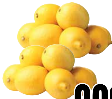
Yellow Lemon Limon Amarillo