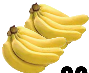
Golden Ripe Bananas Plátanos