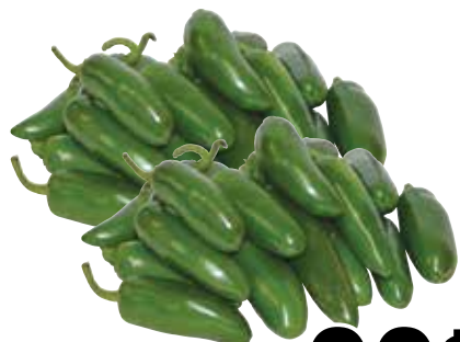
Fresh Jalapeño Peppers Chile Jalapeño