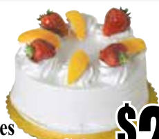
3 Leches Double Layer Cake 8" Round