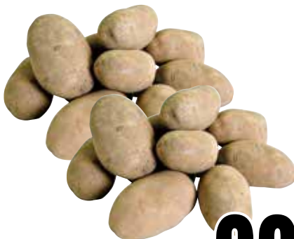
Russet Potatoes Papas Russet