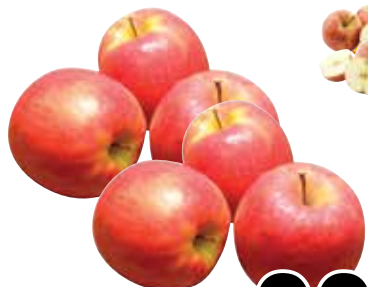
Pink Lady Apples Manzana Pink Lady