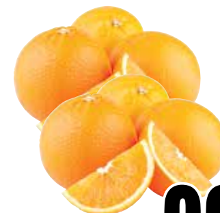
Fresh Oranges Naranjas Dulce