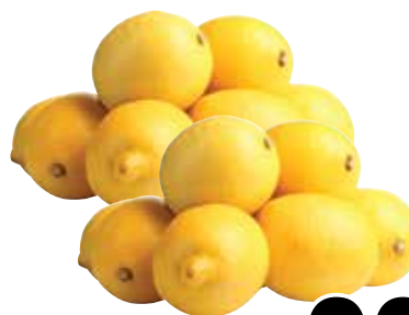
Yellow Lemons Limón Amarillo