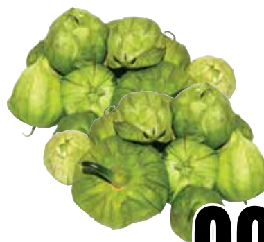
Fresh Tomatillos Tomatillos Fresco