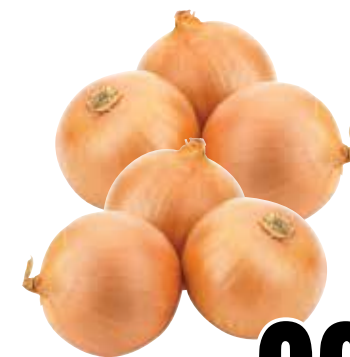
Brown Onions Cebolla Cafe